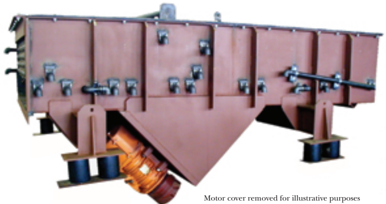
Motor cover removed for illustrative purposes